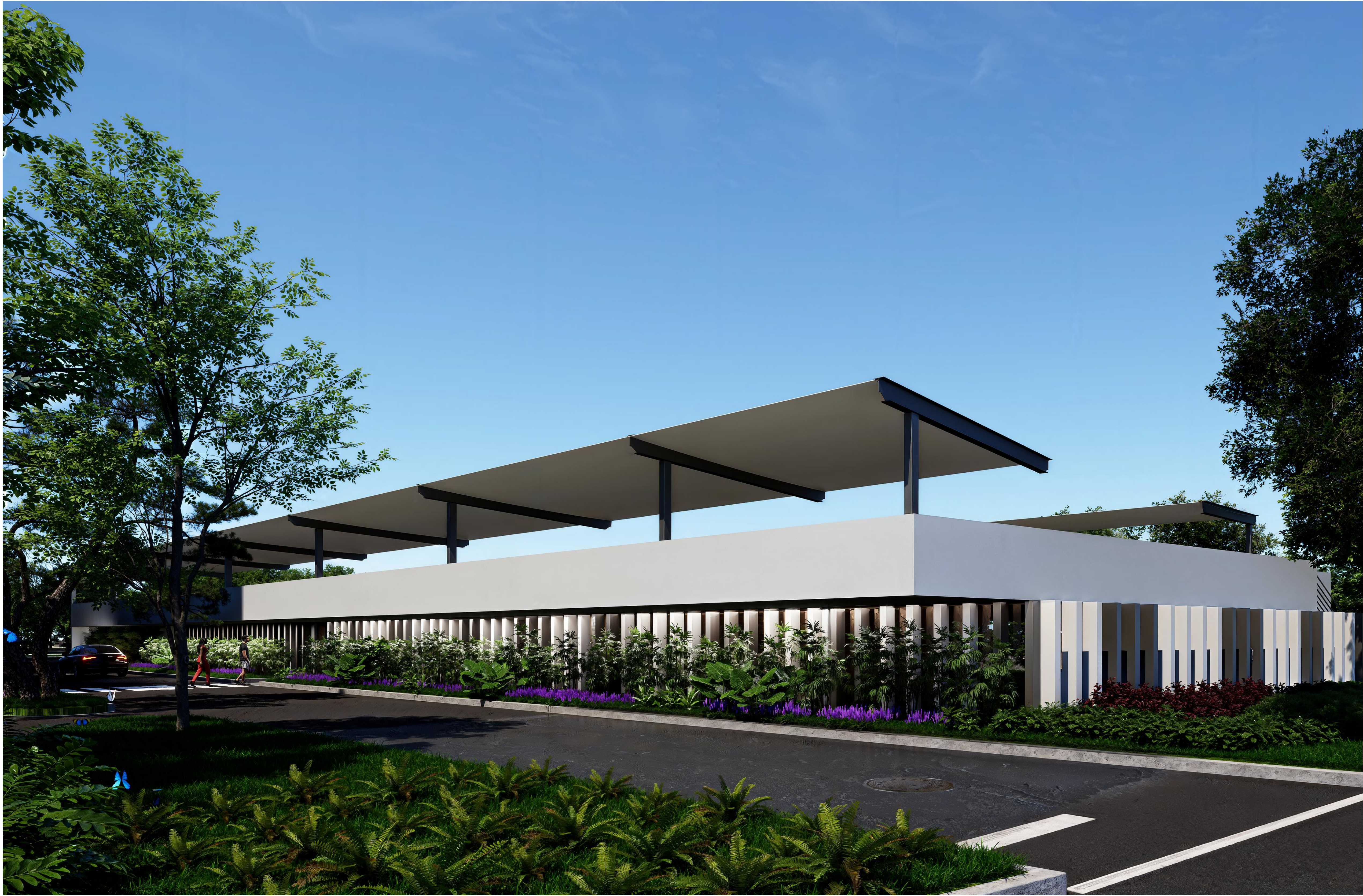
2-STORY PARKING STRUCTURE